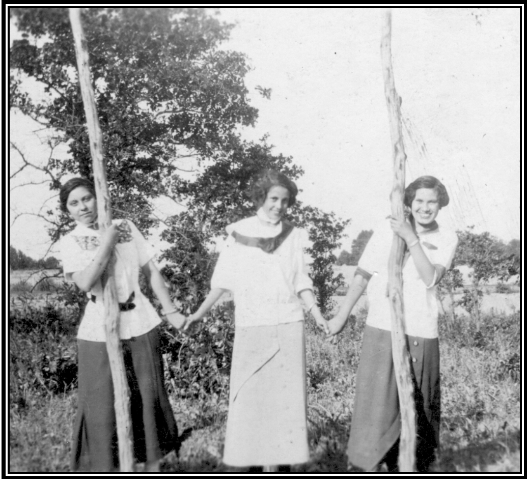
Three Delaware Women Showing the Football Goalposts about 1920

The Goalposts are on the ends of the field. They are made of trees or posts about 5 or 6 inches in diameter which have had the branches removed. They are about 15 foot high. There is no crossbar as in the white man's football goalposts. The two on each end of the field are spaced about 6 feet apart.