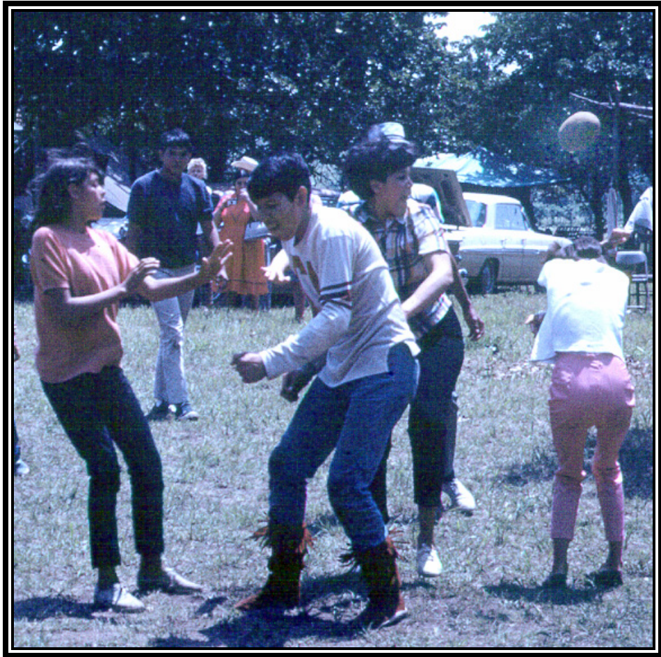
Some Younger Delawares Playing the Game in 1965